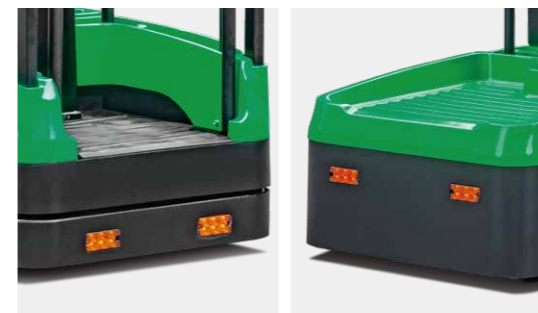
Front and rear flashing lights