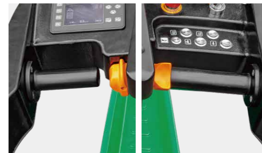
Right and left hand sensing